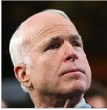
Bloggingheads Video: McCain on Virtue