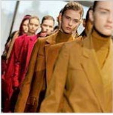
New York Fashion Week: Complete Coverage