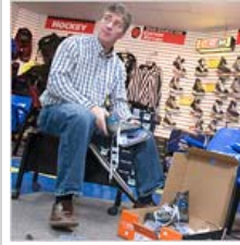
Nike Seeks to Sell Hockey Equipment Unit