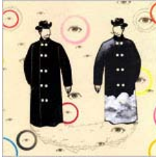
Feel Like a Fraud? At Times, Maybe You Should