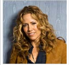
Basking in the Sun Though Wary of a Storm