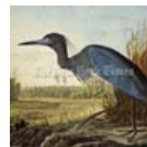
Blue Crane or Heron, Plate 307 Buy Now